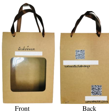
Front Back Fig. 6. Outer packaging.