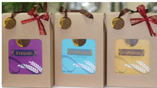
Fig. 4. New packaging in a bag.

chose both sizes of packaging in buying and selling. Ninety percent of the community enterprise members chose logo “A” in Figure 3 for their brand. The majority of consumers (70%) and 80% of the members of the community enterprise agreed on the same style as shown in Figure 8. The majority of consumers (80%) and 90% of the members of community enterprise agreed on both outer packaging styles. Eighty percent of the 10 visually impaired people interviewed agreed that the new packaging was very helpful in making free and equal shopping choices in society. Seventy percent of those with visual impairments interviewed said that the braille on the packaging was meaningful, and 80% commented that the QR Code can be scanned to access information well but need to tell the distance between mobile phone and QR Code, and 70 % of those with visual impairments thought that the QR Code link was correct.