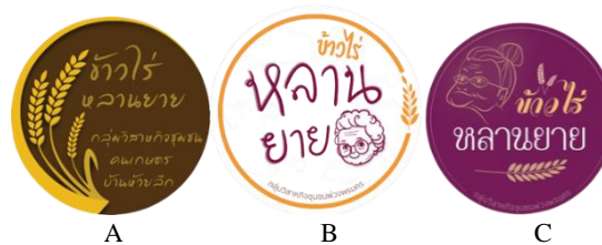
Fig. 3. Logo of new brand.

Ninety percent of community enterprise members agreed that the logo “A” (Figure 3), inner packaging, and outer packaging are attractive and provide all necessary information about the product descriptions. The product label Type II (Figure 7) was their favorite. Moreover, 80% of consumers agreed that voice information was appropriate, and 70% of consumers said that the video was appropriate and compelling. The majority of consumers (70%) and the member of the community group (80%)