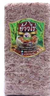
Fig. 2. Original brand and packaging

An upland rice packaging design prototype was carried out according to the requirements of related people and design theories. The original brand and packaging of the community enterprise are shown in Figure 2. The results of designing new upland rice packaging showed that packaging includes: 1) logo 2) product label 3) the inner packaging was a vacuum seal plastic bag, and 4) the outer packaging was a kraft paper bag and a kraft paper box. There were two sizes of packaging development: 1 kilogram and 500 grams. There were three styles of product labels design of three kinds of rice; Sangyod rice, Hom Bon rice, and Dokkha rice. There were two types of outer packaging: a paper bag with handle (Figure 4) and gift boxes (Figure 5). Braille characters appeared on the packaging on the front of the box indicating the product's name. The top back of packaging had braille with a QR code to scan to get a link to audio data about product details (which consisted of rice name, nutrient, benefit, price, quantity, cooking method, date of manufacture, and expired date.) The top back of packaging had braille with a QR code to scan to get a link to audio information and video about upland rice planting tradition (Figure 6).