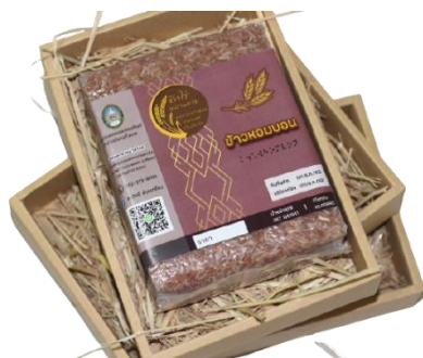
Fig. 5. New packaging in a box.